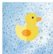
Android (Not Available)

The above images are of the Duckworth-Lewis Standard App.