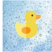
Android (Not Available)

The above images are of the Duckworth-Lewis Standard App.